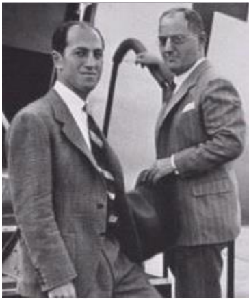
Ira Gershwin (on the right) with his brother George.

http://riverwalkjazz.stanford.edu/sites/default/files/wp-content/uploads/2011/10/gershwins.jpg